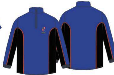
Fleece 100% Polyester Anti pill coating with sun protection Embroidery left chest