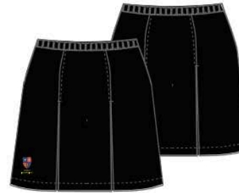
Skirt 100% Polyester Attached bike short liner Embroidery right leg