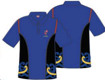
Short Sleeve Polo 100% Polyester Anti pill coating with sun protection Embroidery left chest Sublimation side panels