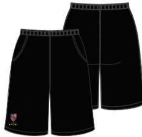
Shorts 100% Polyester Breathable, anti pill coating with sun protection Embroidery right leg