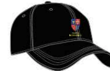
Cap 65% Polyester, 35% Cotton Fade resistant, elastic fastening Embroidery centre front