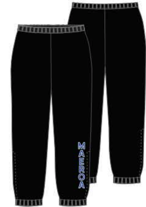
Trackpants 100% Polyester Full elastic waist with internal drawcord Print on the left leg