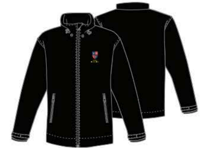
Softshell Jacket 320gm 2-layer performance softshell 95% Polyester, 5% elastane outer, 100% bonded fleece inner Embroidery left chest