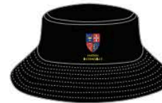
Bucket Hat 100% Microfibre Elastic draw-cord around crown with slide toggle Embroidery centre front